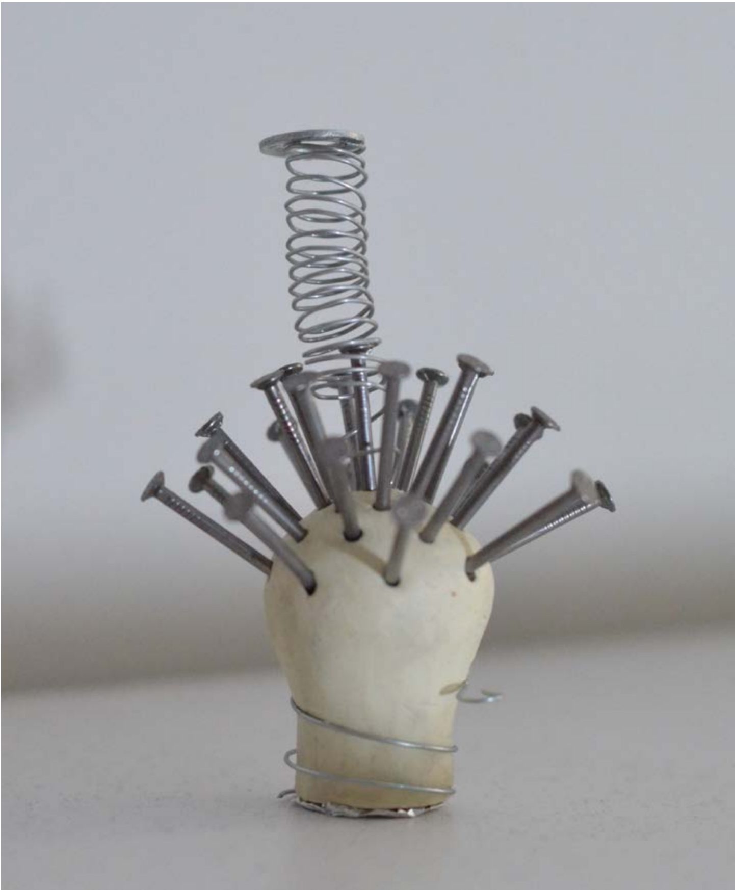
What's on Your Mind?