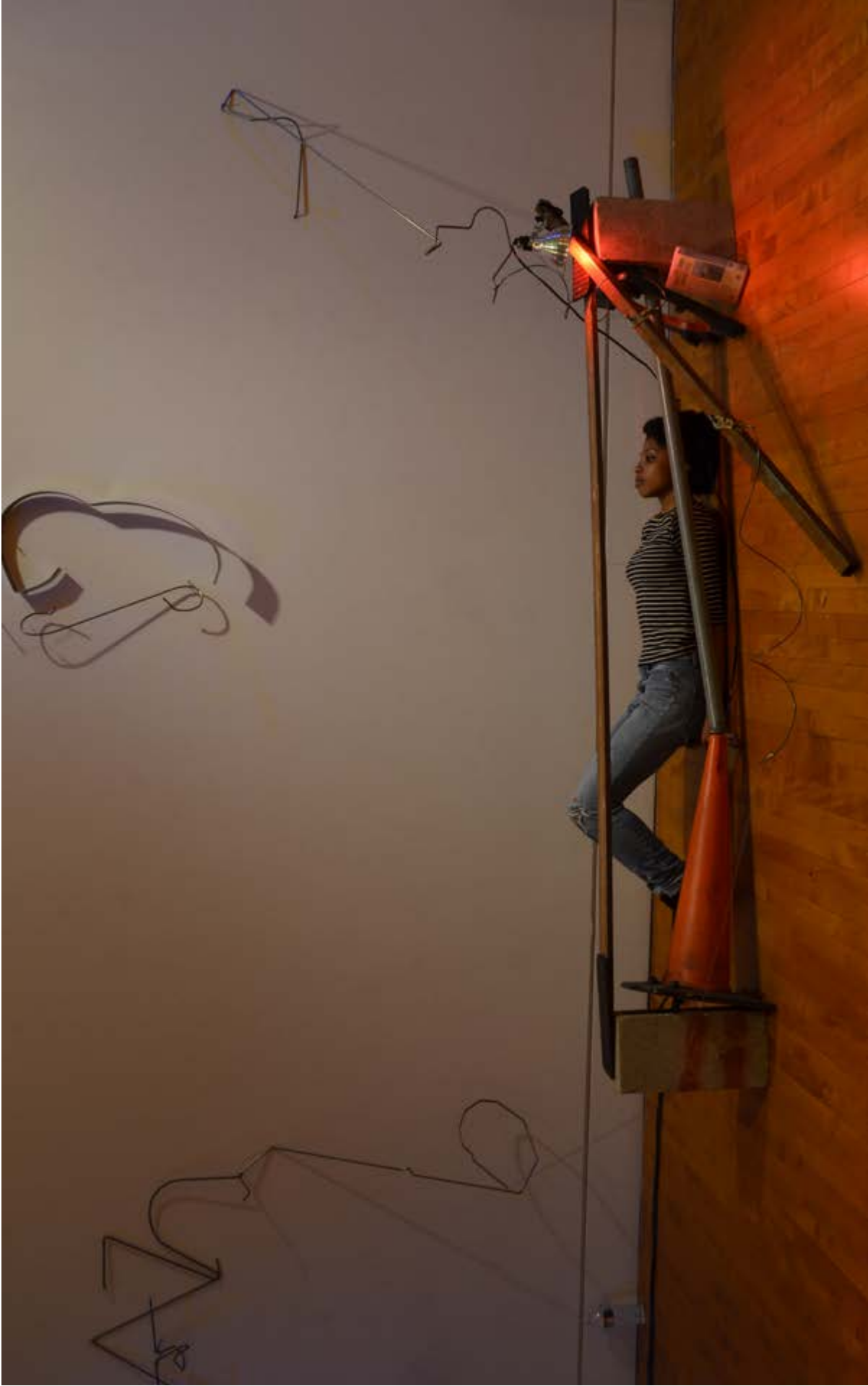
Bed 2014 Wood, Concrete, Plastic, Metal, Red Light