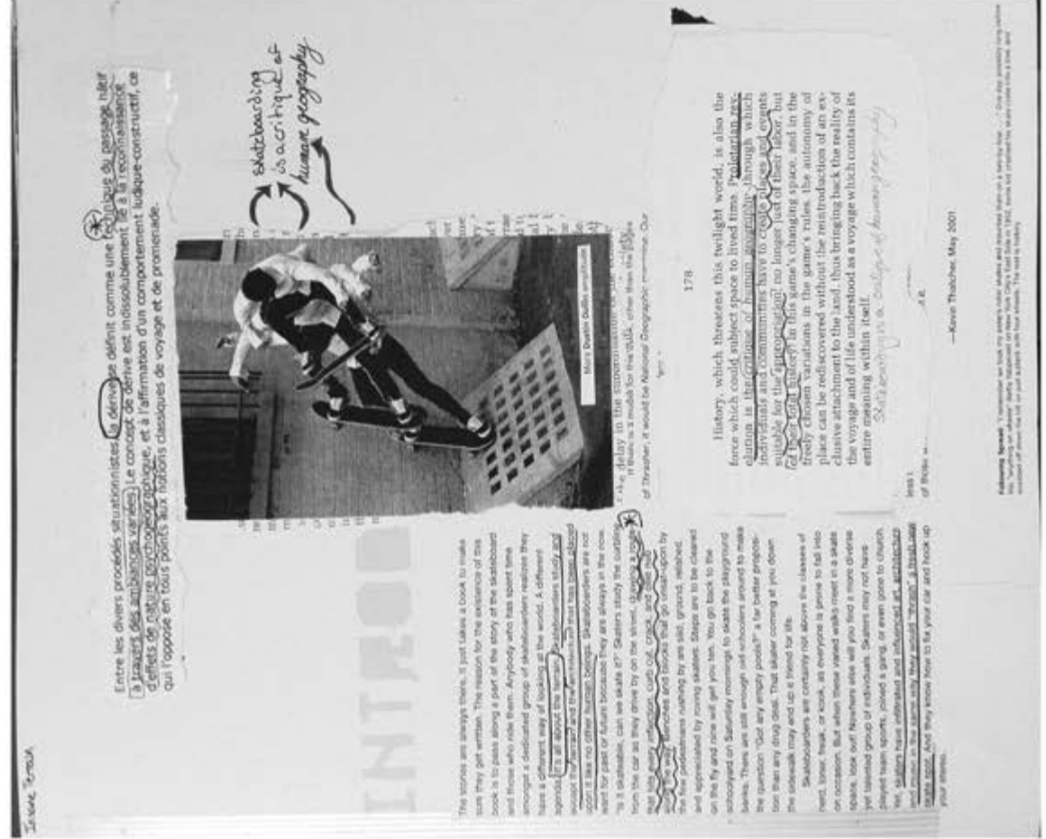
"Rewriting Society of the Spectacle" excerpt, 2013