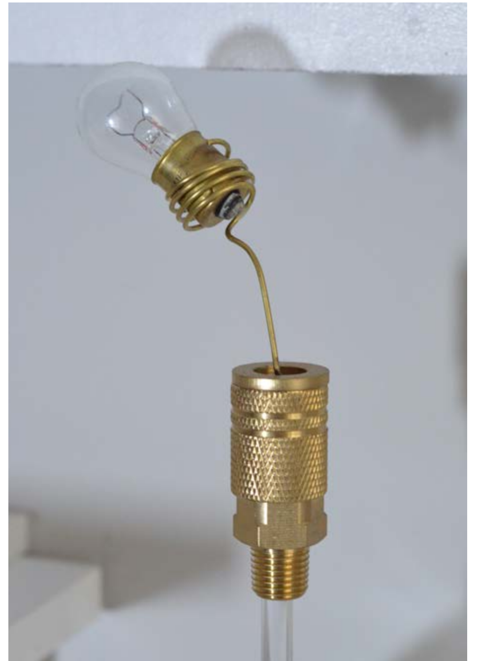
Swindle 2019 Glass, Metal, Silicone