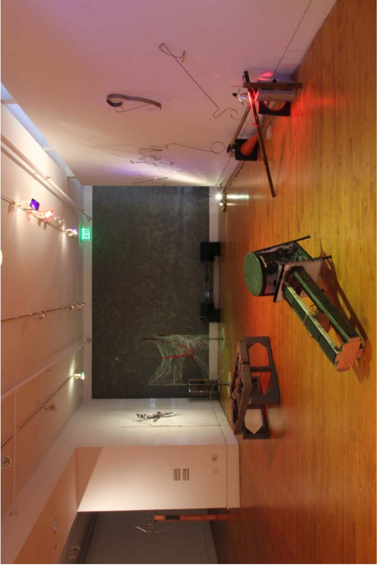
Panama Canal Installation Shot