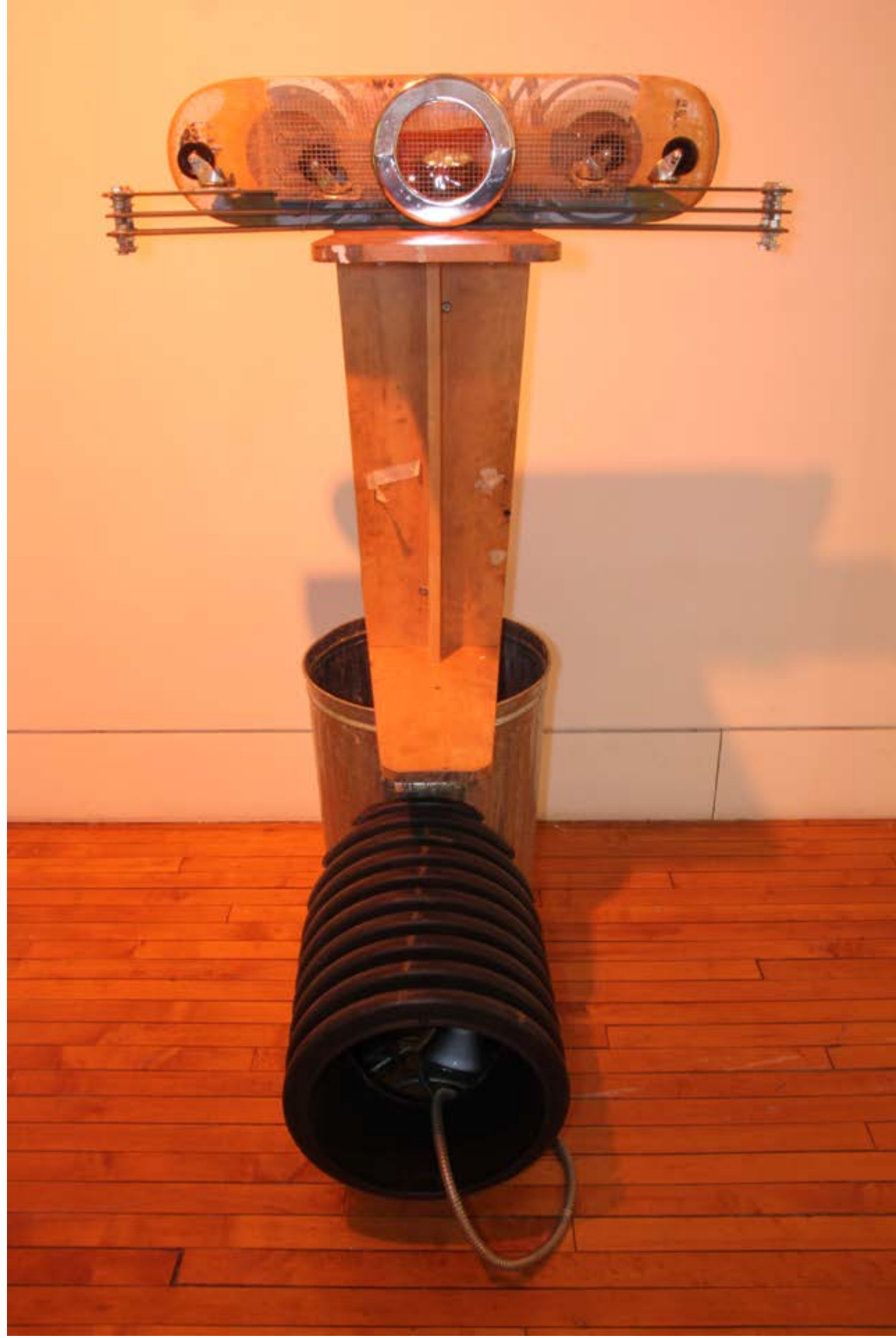
Surveillance or The Eyes Below Our Feet 2014 Wood, Metal, Wire Mesh, Skateboard