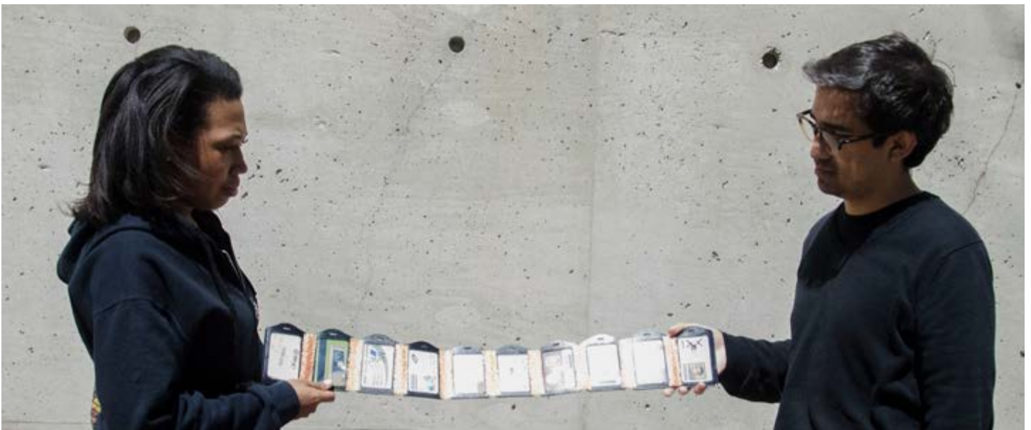
Objects of Transparency: ID Foldout Plastic, Glue, Cloth, Paper 2016