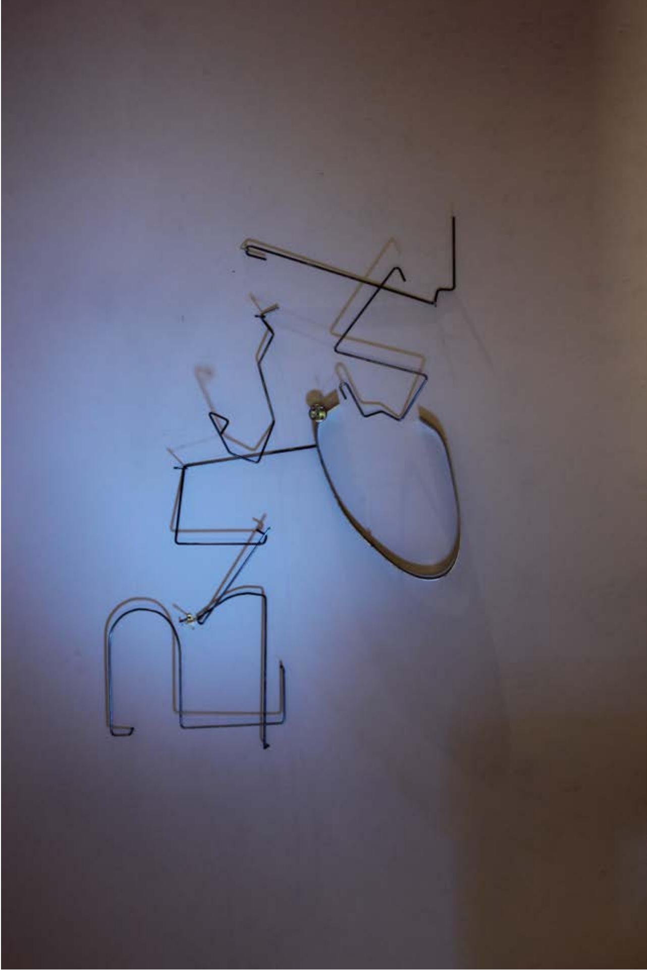
Panama Canal 2014 Metal, Blue light